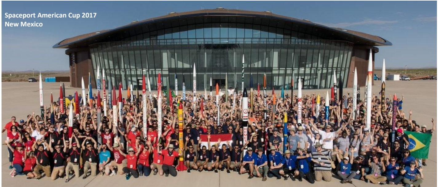
Spaceport American Cup 2017 New Mexico